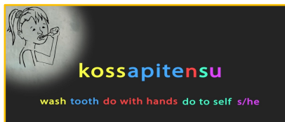
“she brushes her teeth”