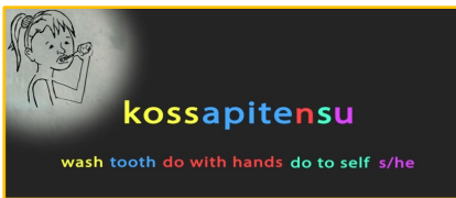
“she brushes her teeth”